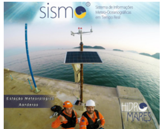
HidroMares used an image of its Aanderaa wind and visibility instruments as a lead image to promote its SISMO® monitoring system.

Thank you HidroMares for the information and photos used in this application note.