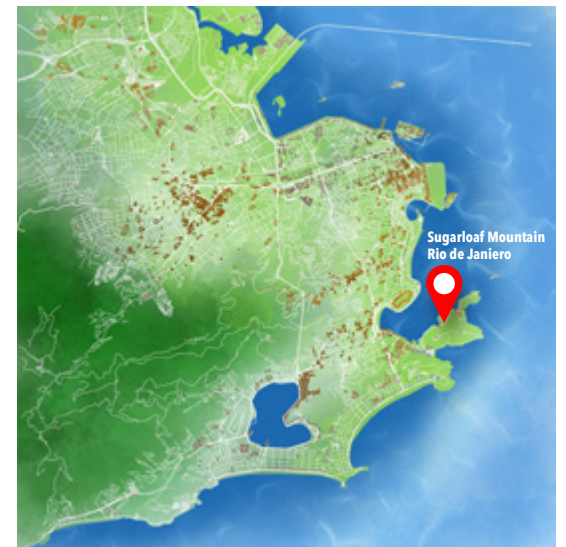
Rising 396 m (1,299 ft) above the harbor, Sugarloaf Mountain is a peak situated in Rio de Janeiro, Brazil, at the mouth of Guanabara Bay on a peninsula that juts out into the Atlantic Ocean.

“The terminal doubled the operational time and efficiency after navigation was authorized at night as a result of the SISMO implementation,” he reports.