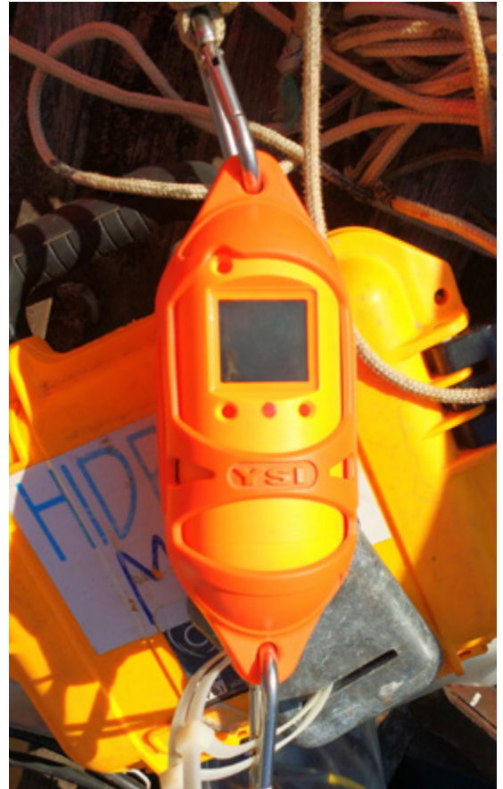
The SonTek CastAway-CTD measures conductivity, temperature, and depth.

"The way HidroMares has linked Argonaut ADCPs and the Mira visibility sensor on Tideland buoys with Geoview software—then supports the data with measurements from CastAway-CTDs—reflects the deep knowledge they have of the products they represent," Jones notes. "But what's even deeper is their understanding of what their customers—the pilots, ship captains and harbormasters—need in order to operate safely and efficiently. SISMO is an outstanding example of applying great technology to not just generate data, but to deliver it in an elegant, customer-focused way."