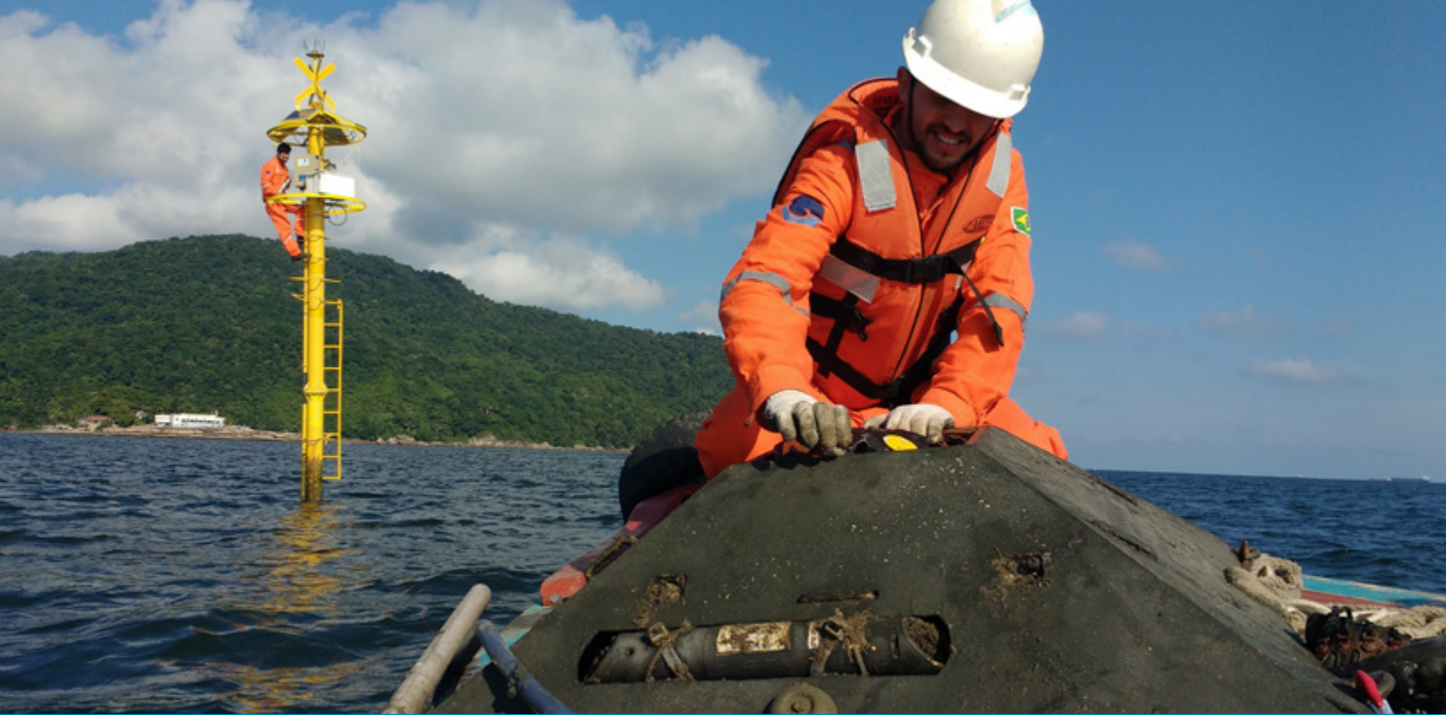
Hidromares technical ADCP experts provide regular maintenance on the Argonaut-XR to ensure optimum performance.