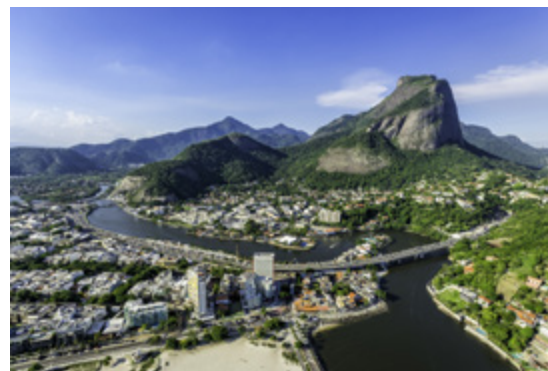
Aerial view of Rio de Janeiro's harbor under Pedra da Gavea Mountain, Brazil, shows how the harbor forks, twists and turns, making it extremely difficult to navigate ships 43-meters wide through a channel just 200 meters wide.

It's little surprise, then, that the Rio de Janeiro pilots' association, whose members are responsible for guiding any non-Brazilian ship into those ports, requested that the port owners install the innovative SISMO®—in Portuguese, an acronym for Real-Time Meteocean Monitoring System—in the bay. Their colleagues in Sao Paulo state have used a SISMO system since 2013, which transmits current, level, tide, temperature, wind speed/direction and visibility data directly to their smartphones.