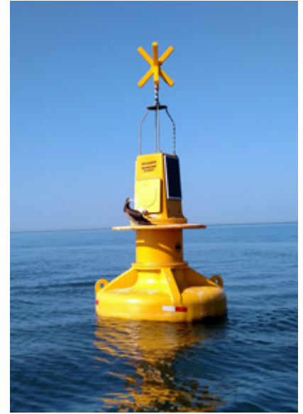
One of two buoys in the Rio de Janeiro SISMO system, with its hatch open to allow maintenance crews access to datalogging and telemetry equipment.

“The data the pilot or operator sees is from 10 seconds ago to five minutes ago,” Paschoal says. “Practically instantly they have visualization of data.” SISMO also sends alarms to pilots and port staff when currents, waves or winds become hazardous.