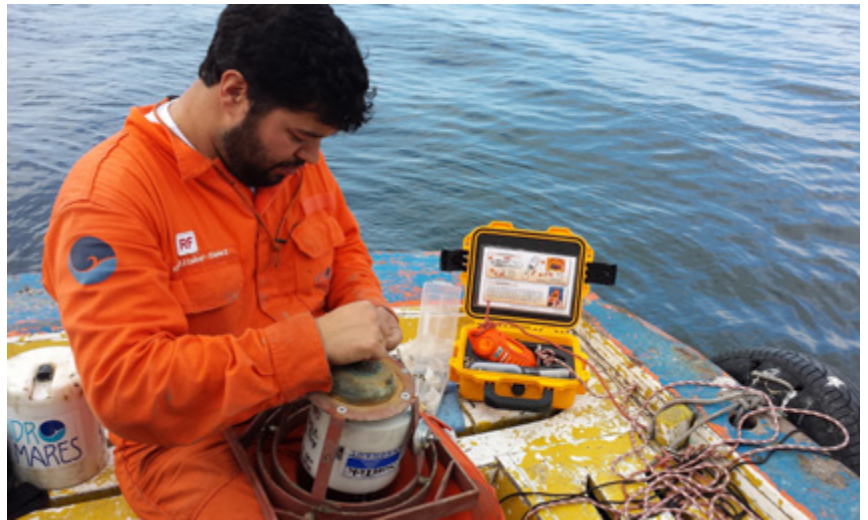
A portable case is used to transport the telemetry system to the boat for more convenient and safer maintenance.

A team of divers from HidroMares makes a maintenance visit to each Rio de Janeiro SISMO installation every 45 days. Paschoal says the Argonauts and other instruments are highly reliable and easy to maintain. Most of the work is ensuring that sediments have not buried the ADCPs, cleaning up summertime biofouling, and ensuring that cables are intact. The telemetry system is packed in a portable case that can be transferred from the buoy to the boat for more convenient, safer maintenance before being plugged back into the instruments and transmission antenna.