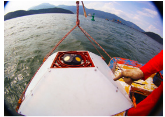
The HidroMares team deploys SonTek Argonaut-XR ADCPs—three in total—to continuously monitor currents in a forked, narrow channel in Brazil’s Rio de Janeiro state. The pyramidal housing protects the current profilers from damage in the busy port.

“Every turn for a vessel is really problematic,” says Paschoal, whose degree is in oceanography. “Pilots and naval engineers always say a vessel is only built to navigate straight, not to turn.”