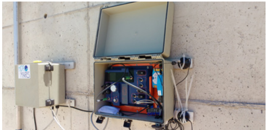
Visibility and wind data at the port's pier is gathered in an Aanderaa Smartguard datalogger and transmitted every few minutes to pilots and harbormasters.