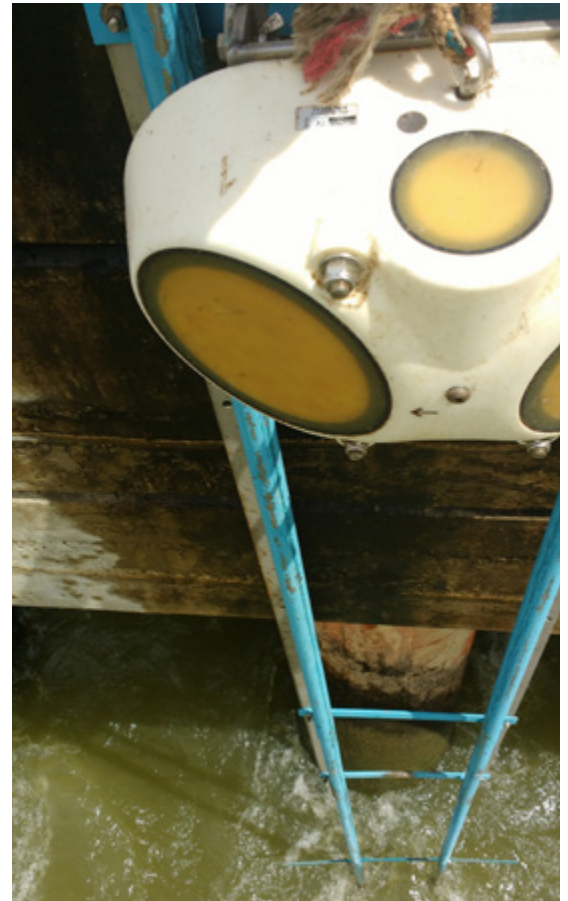
Durable equipment designed for long deployments such as this Argonaut-SL500 allows HidroMares teams to extend the maintenance interval for each SISMO installation to 45 days.

Even before installing SISMO for the Rio de Janeiro ports, HidroMares had gathered four years' worth of continuous current, wave, level and bottom temperature data in Sepetiba Bay at the request of the Brazilian Navy, which had used the site as a submarine building facility. That detailed information helped port owners develop the submarine base into a commercial iron ore loading facility, laying out the channels, sizing the turning basins, and planning logistics.