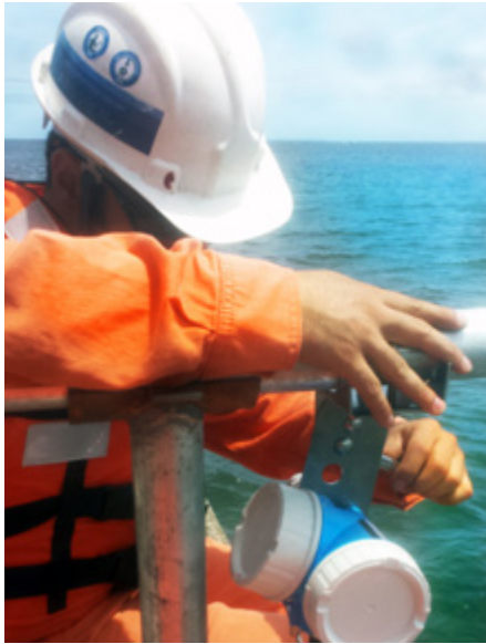
A HidroMares technician prepares a YSI Nile 502 radar water level sensor, part of the company's innovative SISMO® harbor monitoring system.