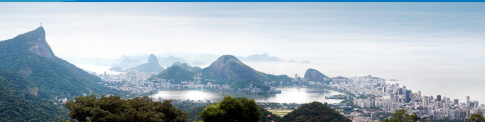
Rio de Janeiro Harbor showing how atmospheric conditions alter visibility making it hard to navigate even for small vessels

XYLEM INSTRUMENTS VITAL ROLE IN RIO DE JANEIRO HARBOR MONITORING